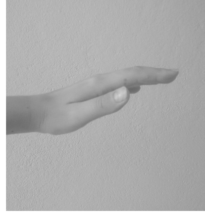
Figure 1. Wrist dorsiflexion with fingers extended 0-20 degrees