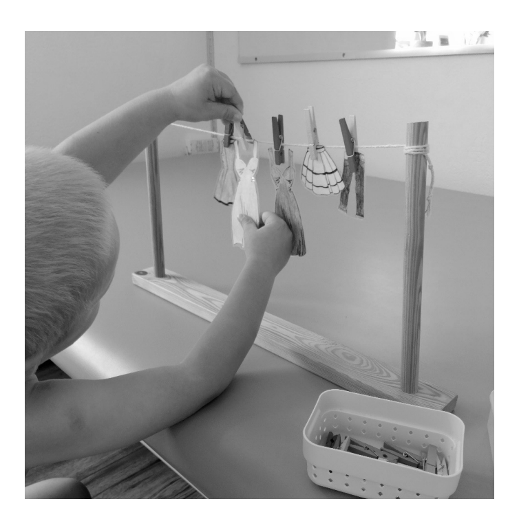
Figure 19. Pinning of paperclips