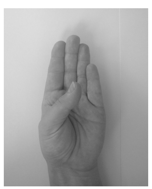
Figure 7. Thumb in adduction, bent at the metacarpophalangeal joint