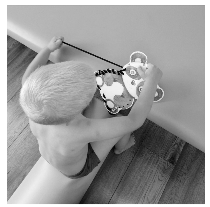
Figure 18. Threading a string through small holes along the periphery of a printed picture