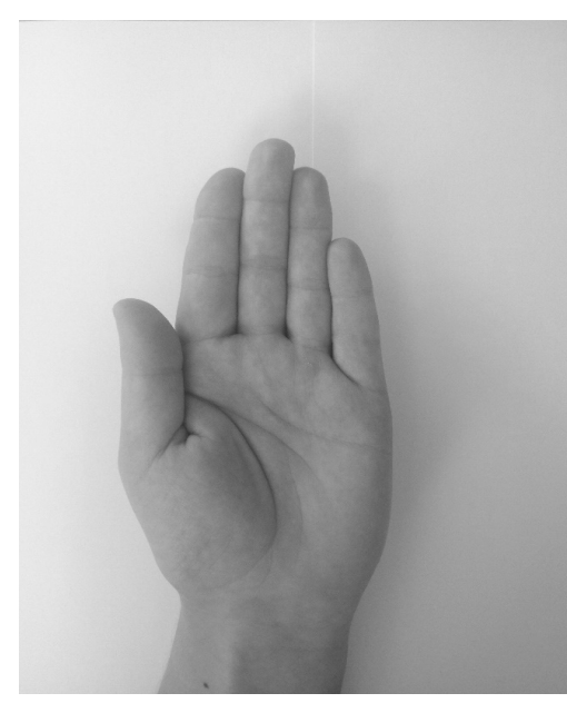
Figure 6. Thumb in adduction