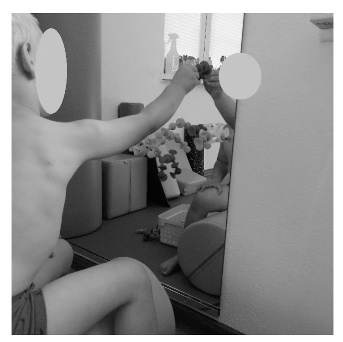
Figure 15. Exercise 3

3. The patient sits perched on a roller and sticks suction cups to a mirror in front of them. This exercise increases extension of the elbow joint and allows the child to practice proper grip. Additionally, when the child reaches for the suction cup, attention should be paid to improving the rotation of the thoracolumbar area (Figure 15).