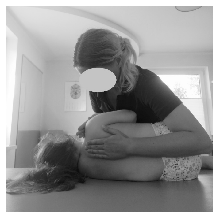
Figure 10. Scapular mobilization

2. Once adequate scapular mobility has been achieved, assisting with pressure techniques should be performed to provide a lot of sensory information to help the patient learn the new ROM. Pressure should be applied both distally (about the shoulder girdle) and proximally (to the knuckle of the hand) (Figure 11).