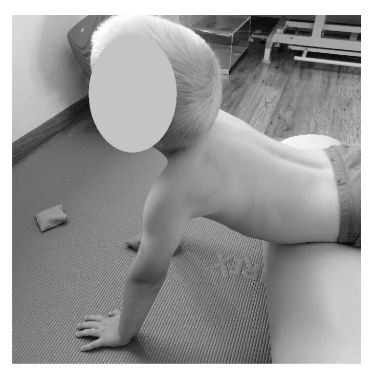
Figure 14. Exercise 1

1. Using a roller, the patient lies on their stomach with bags lying in front of them. The child's task is to grab the bags with one hand and then with the other. By extending the affected arm, the child works to increase flexion of the shoulder joint. Reaching with the unaffected arm works to increase muscle strength and deep sensation in the affected arm (Figure 14).