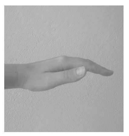
Figure 2. Wrist dorsiflexion with fingers straight less than 20 degrees