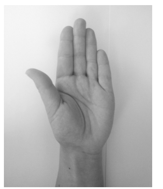
Figure 8. Thumb dislocated at the metacarpophalangeal joint