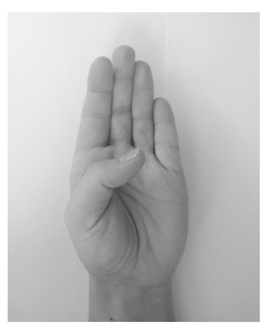
Figure 9. The thumb is adducted and flexed at the metacarpophalangeal and interphalangeal joints