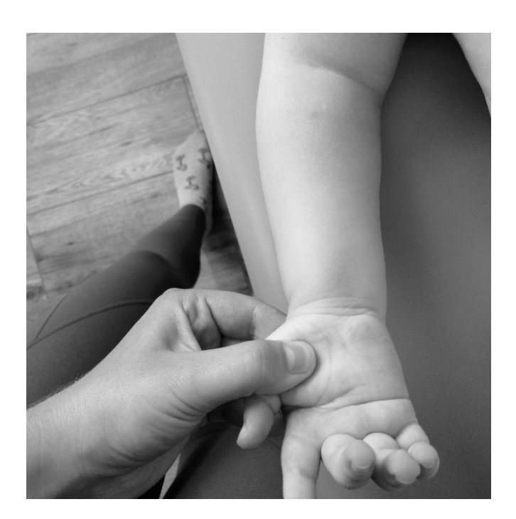
Figure 13. Opening hand

Exercises to increase shoulder mobility and elbow joint extension