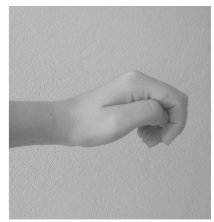
Figure 3. Wrist dorsiflexion when the fingers are flexed